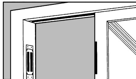
3750 Magnetic locks will secure sliding doors.